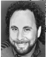
Rich Ceisler Comedy Central, Showtime